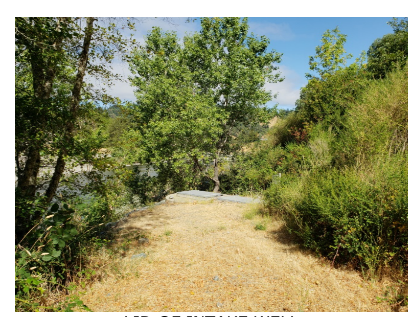
LID OF INTAKE WELL