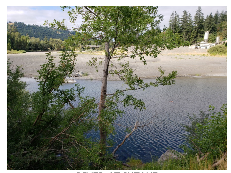
RIVER AT INTAKE